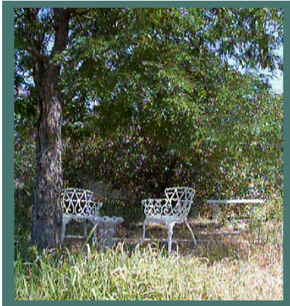
Idyllic Wildflower grounds

In addition to the painting and gourd art demonstrations, Wildflower continues its Saturday Outdoor Artists' Festivals and Artists' Markets for Wildflower guests to meet and exchange ideas, and for visitors to shop among many different kinds of art. The markets are easily accessible on the gallery grounds with convenient parking interspersed among acres of wildflowers and will run from 10:00 to 4:00 each Saturday in July and August.